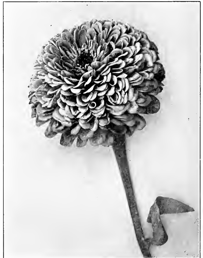
ZINNIA—DAHLIA FLOWERING GOLDEN STATE